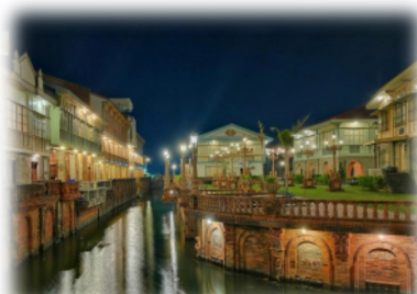
LAS CASAS FILIPINAS DE ACUZAR